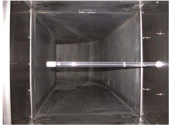
Figure 2-2. Lamp installed inside the test rig.

For more information on the Bio-Fighter 4Xtreme, Model 21, contact: