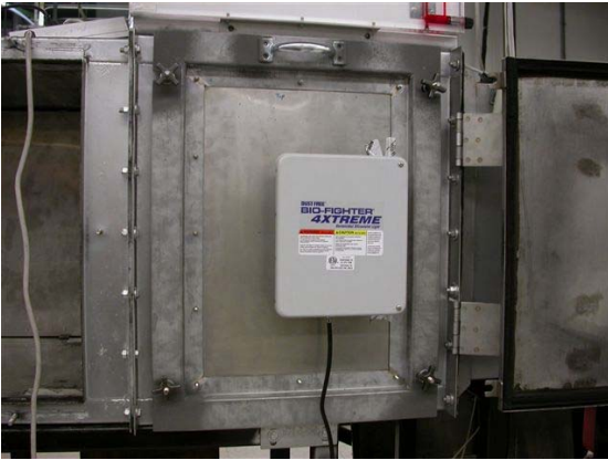
Figure 2-1. Ballast box installed on the outside of the test rig.