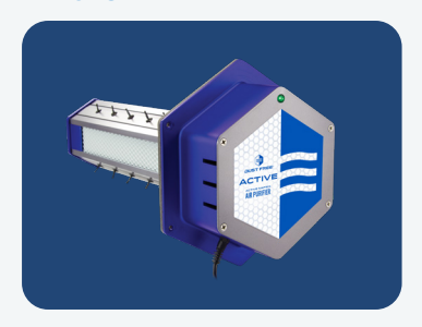
The Active 12" is suitable for residential and commercial applications.