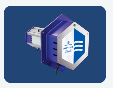
The Active 6" for residential applications up to 2.5 tons.