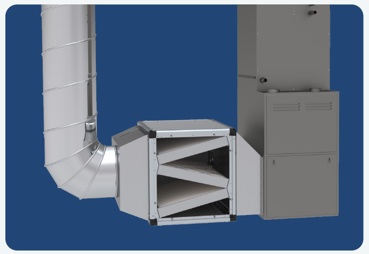
Engineered to seamlessly integrate into the return air stream of upflow, horizontal, attic, and basement HVAC systems.